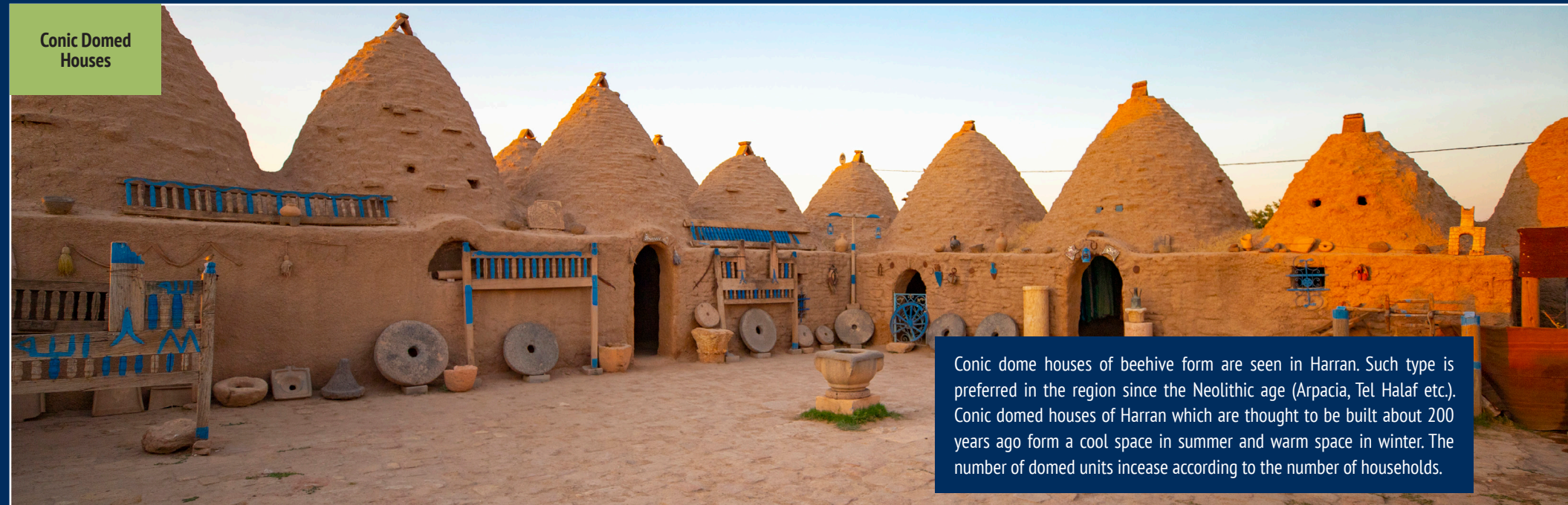
Conic Domed Houses

This is known as the first great mosque of Anatolia with the richest stone engravings and the greatest courtyard with fountain and porches in its time. Harran Ulu Mosque, also referred to as Paradise and Friday Mosque, is located to the north east of the mound. Its eastern gate, shrine, courtyard gate, fountain and minaret are in good condition. The mosque was built almost in a square plan. Its sanctuary has four naves extending along the shrine wall. It has a wide courtyard surrounded by 6 gates and porches and adorned with a fountain. Upper part of its square plan stone minaret is made of brick. İbn Şeddad narrates that a mosque was built at the place where the Moon Temple existed when Harran was conquered in 639. The mosque was converted to a masonry building by Mervan II. In the middle of XIth Century, Nureddin Mahmud Zengi enabled the construction of 3th nave and Melik el Adil the 4th, and thus it took its final form. The inscription in Arabic on the east gate of the mosque is dated to 1192.